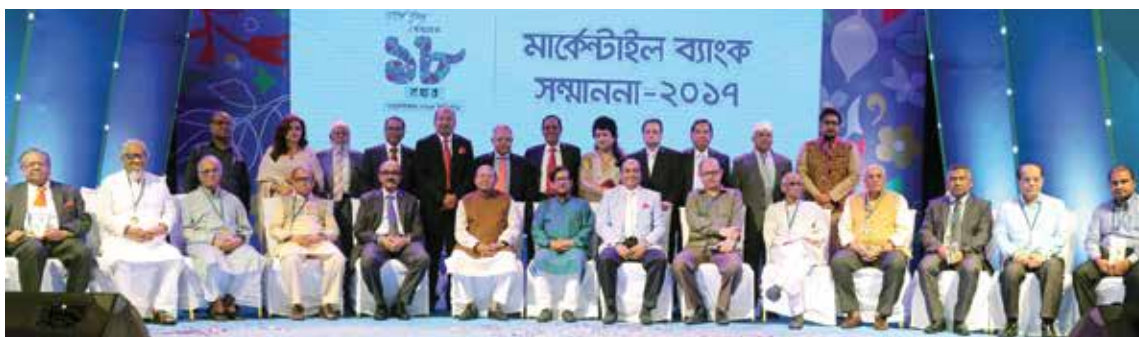
Awardees of Mercantile Bank Award-2017

As a part of Mercantile Bank's CSR activities Education Scholarship Program began its journey from 2011. Education Scholarship program is an explicit expression of MBL's motive towards building the nation through extending hands of assistance to the future generation of the country. In this circumstance, Mercantile Bank Foundation launched a Scholarship program in the name and style, " Mercantile Bank Abdul Jalil Education Scholarship " for the meritorious and poor students across the country under the category of J.S.C, S.S.C and H.S.C.