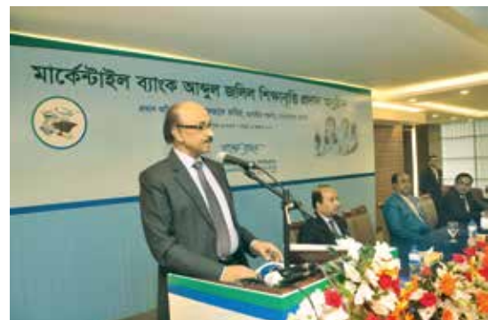
Mercantile Bank Abdul Jalil Education Scholarship Distribution program